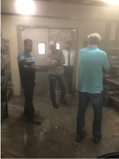
Conditioned room at CalPortland lab where project concrete cylinder samples are stored until ready for testing.