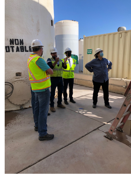
Admixture containment area at CalPortland Glendale plant – discussing admix uses.