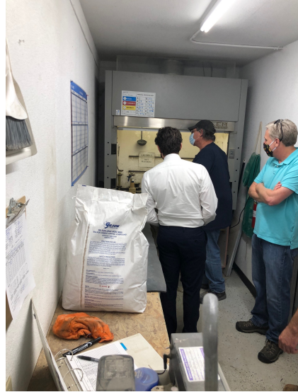
CalPortland QC Tech explaining compression/strength testing apparatus.